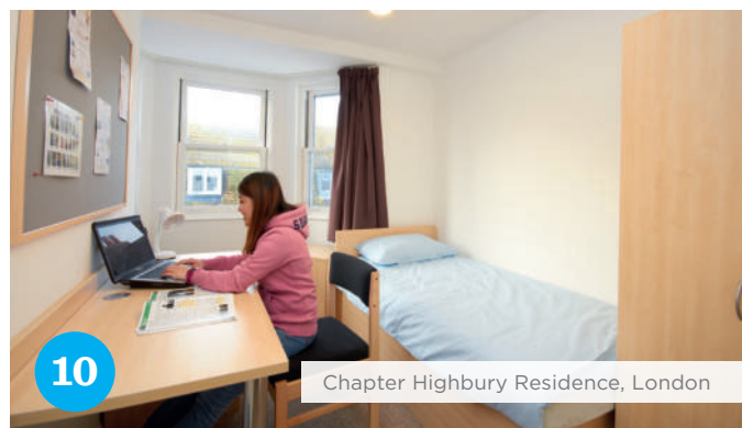
Chapter Highbury Residence, London