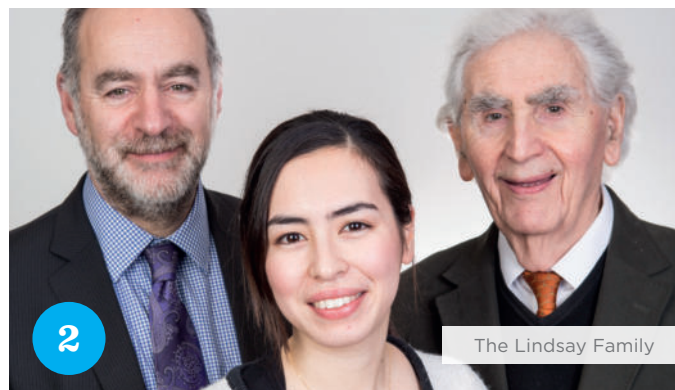
The Lindsay Family