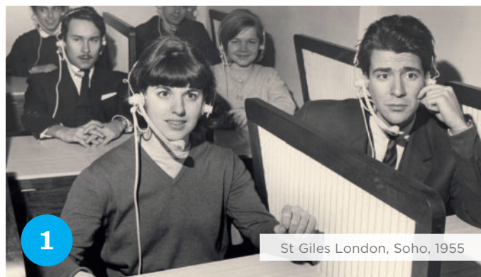
St Giles London, Soho, 1955