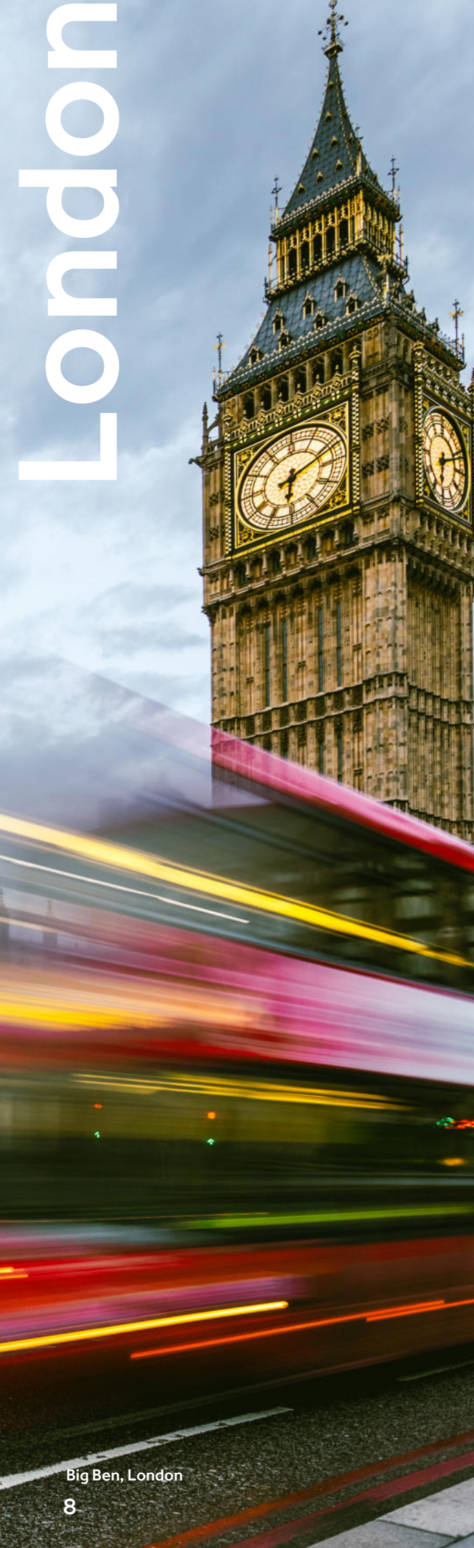
Big Ben, London