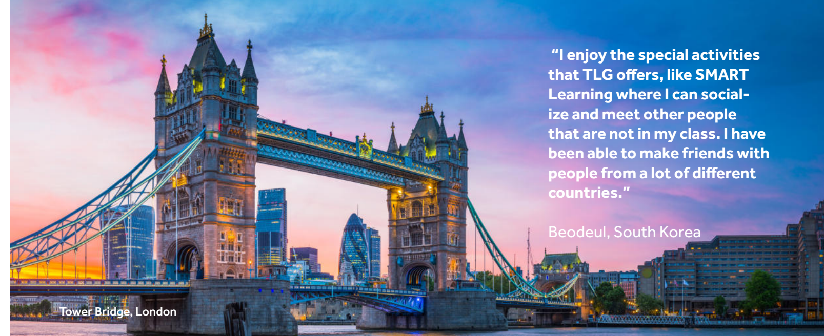
Tower Bridge, London

"I enjoy the special activities that TLG offers, like SMART Learning where I can socialize and meet other people that are not in my class. I have been able to make friends with people from a lot of different countries."