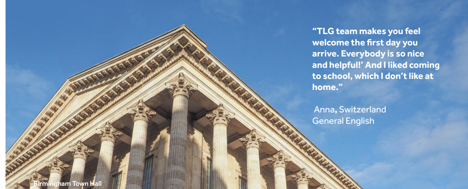
Birmingham Town Hall

"TLG team makes you feel welcome the first day you arrive. Everybody is so nice and helpful!' And I liked coming to school, which I don't like at home."