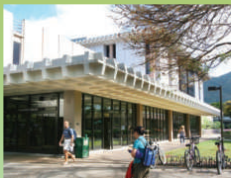
Hamilton Library, UHM

UHM is the main campus of the state's ten-campus university system. It is located in beautiful Mānoa Valley just minutes from downtown Honolulu and the beaches of Waikīkī.